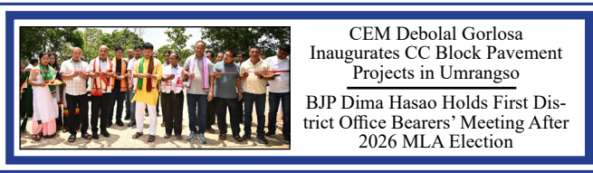
CEM Debolal Gorlosa Inaugurates CC Block Pavement Projects in Umrangso BJP Dima Hasao Holds First District Office Bearers' Meeting After 2026 MLA Election